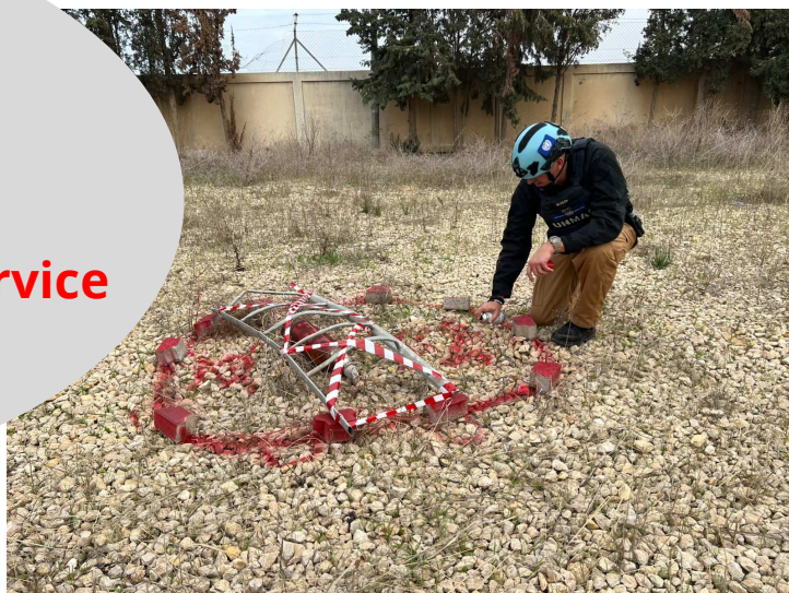
EOD Officers conduct EHA of a logistics base in Rafah. Explosive ordnance found was marked with warning signs. 25 January 2025.