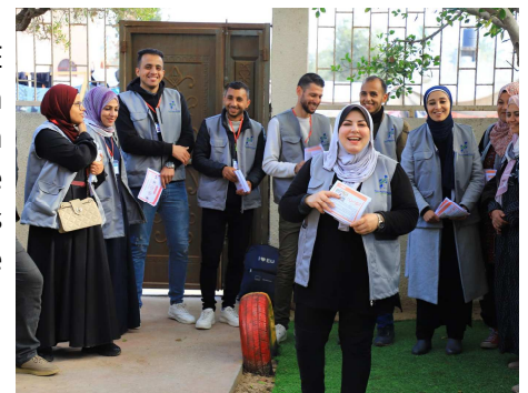
POD facilitators preparing to go into the streets to share lifesaving messaging on the EO threat to people returning to their homes in northern Gaza. 27 January 2025.