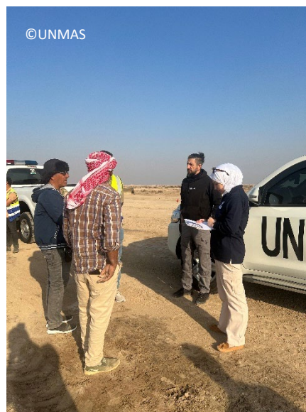
Meeting with the workers of the highway construction company, Shatt Al-Arab district, Basra, December 2024

Substantial mine action operations including explosive ordnance risk education (EORE) activities were carried out by Al-Khebra Al-Faniya (AKAF), UNMAS Iraq national implementing partner, in Basra. The EORE shares essential messages to the communities on the EO threats and demonstrate the safe practices and behavior in the occasion of encountering any explosive threat.