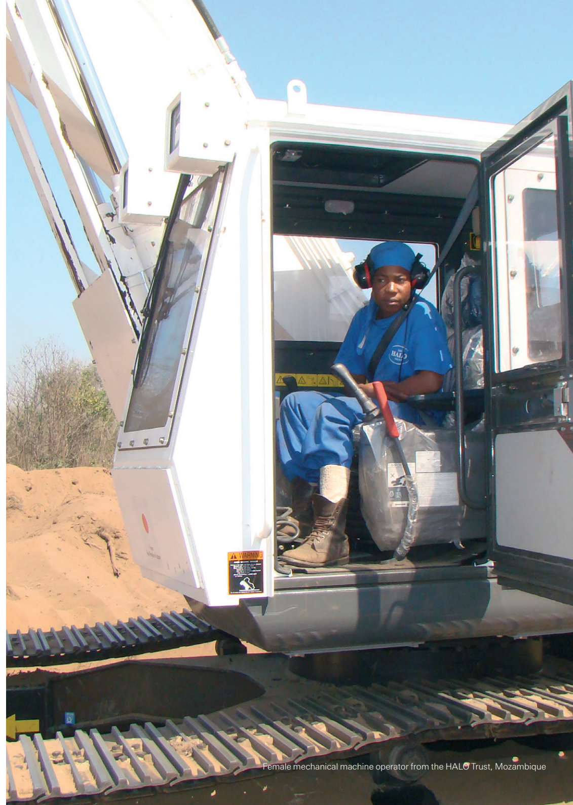
Female mechanical machine operator from the HALO Trust, Mozambique