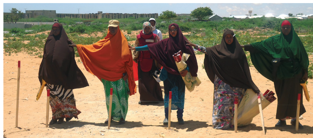
Norwegian People's Aid Battle Area Clearance team during training, ©UNMAS Somalia

In addition to this it is suggested that contracting agencies establish a project review team for contracts/grants that is composed of men and women and ensure that this team receives training on how to evaluate projects from a gender and diversity perspective.