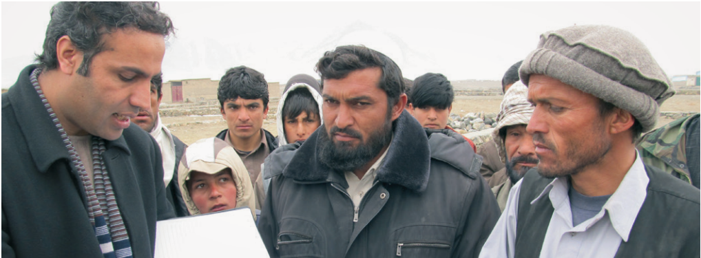
Evaluating the impact of mine action in Afghanistan

To further underline the importance that the contracting agency puts on gender and diversity mainstreaming, financial penalties should be imposed on contractors and implementing partners that do not achieve the targets outlined in the statement of work. In addition to this, the capacity of any contracting agency to successfully implement the gender and diversity component of previous projects should also be evaluated when deciding whether to allocate funding in the future.