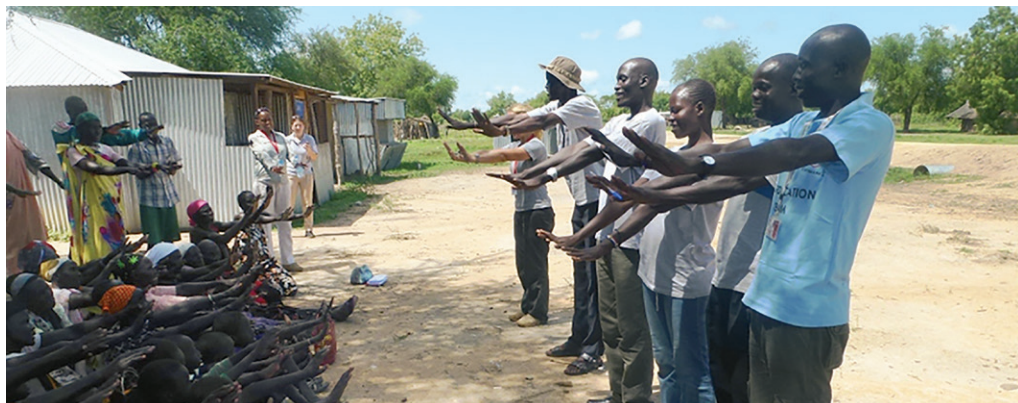
Interactive MRE session