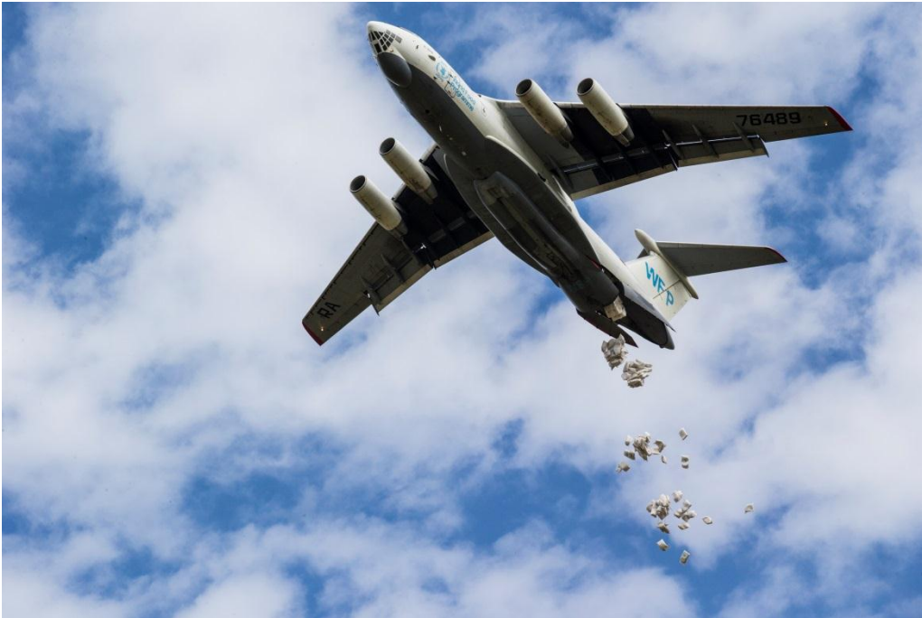
Bentiu, South Sudan.