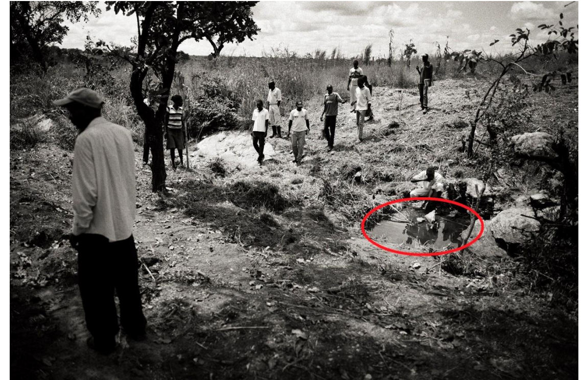
Red circle depicts stream within cleared minefield