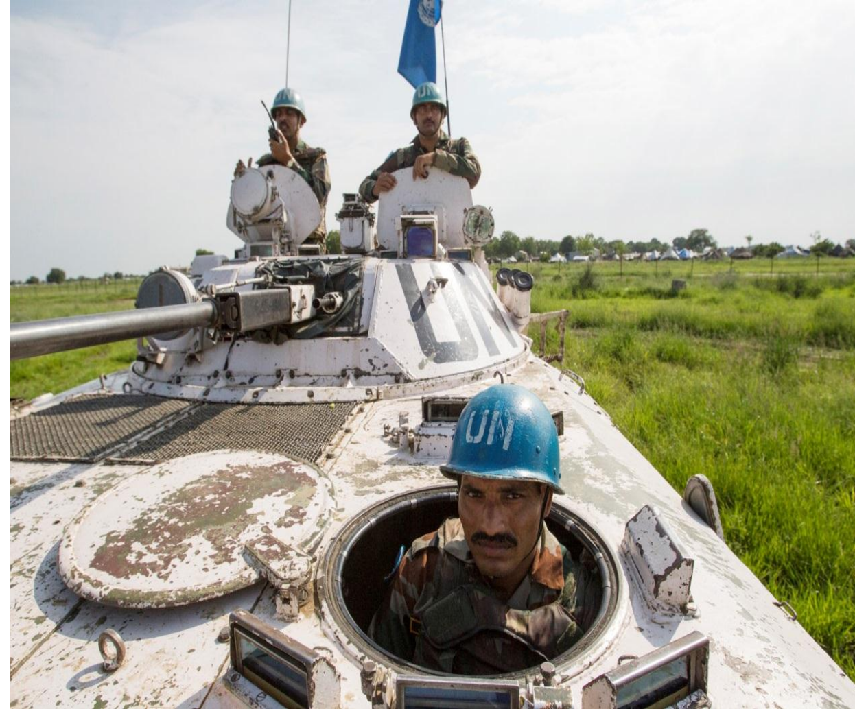
UNMISS patrol, Pibor, Jonglei State.