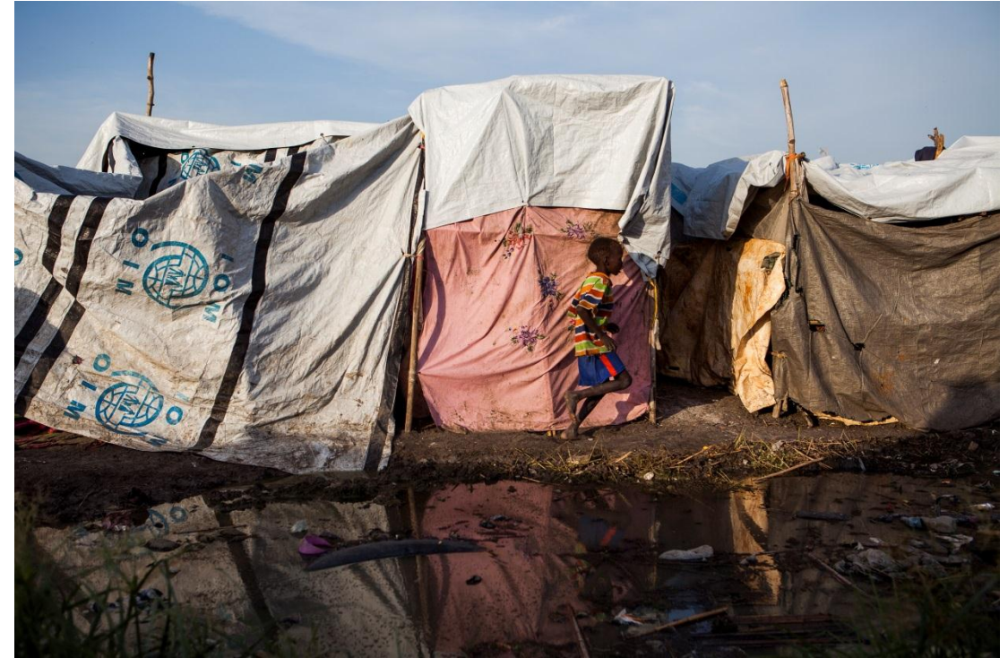
UN PoC site, Malakal.