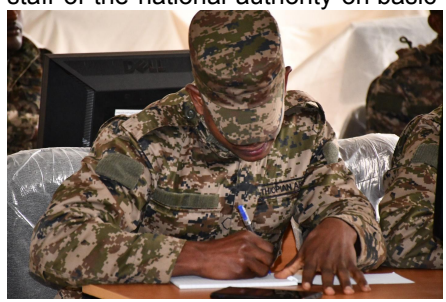
EMAO course participant during one of the joint UNB weations. Addis Ababa, July 202-

During the first training, held from 5 to 7 August 2024, and focusing on basic computer skills. 15 EMAO staff better members got to