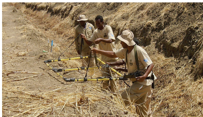
Battle Area Clearance along the UNISFA drainage trench near Abyei town

UNMAS organised a series of events to commemorate the International Mine Awareness and Support to Mine Action Day on 4 April for both the local community and UNISFA staff.