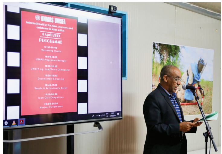
UNISFA Acting Head of Mission/Force Commander's speech