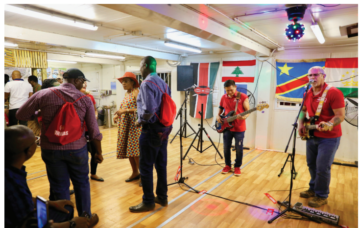
UNMAS musical performance

IF YOU SEE AN ITEM OF CONCERN, DO NOT TOUCH IT! CONTACT UNMAS IMMEDIATELY!