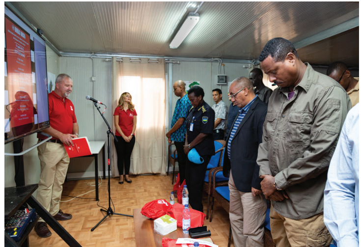
UNMAS Programme Manager calling for a minute of silence

Following the speeches, the event continued with the screening of the videos, followed by a quiz and wrapped up with a live musical performance.