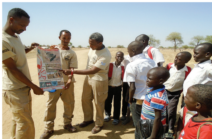
Mine risk education at Akcenhial village