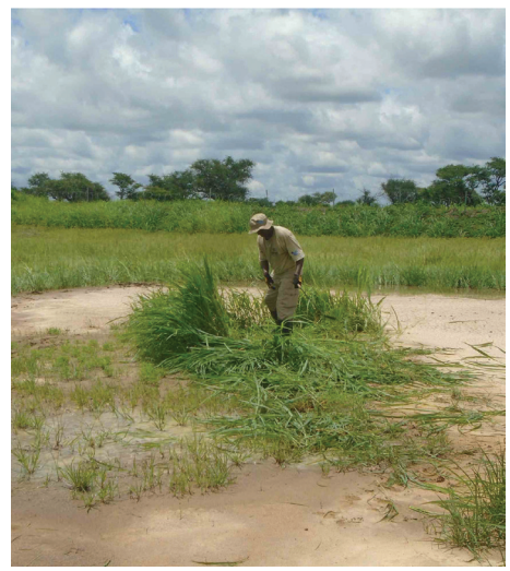
Preparation of the HLS