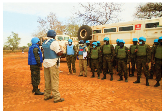
Ground monitoring mission at TS-21

2 UNISFA military and civilian staff received safety training