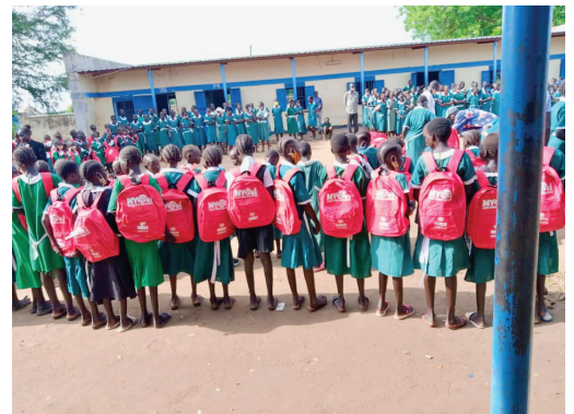
School bags distributed in Abyei

600 UNMAS school bags distributed to the Abyei Girls Primary School