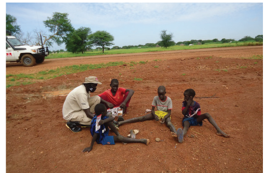
Explosive ordnance risk education in Abyei

69 Explosive Ordnance Risk Education sessions