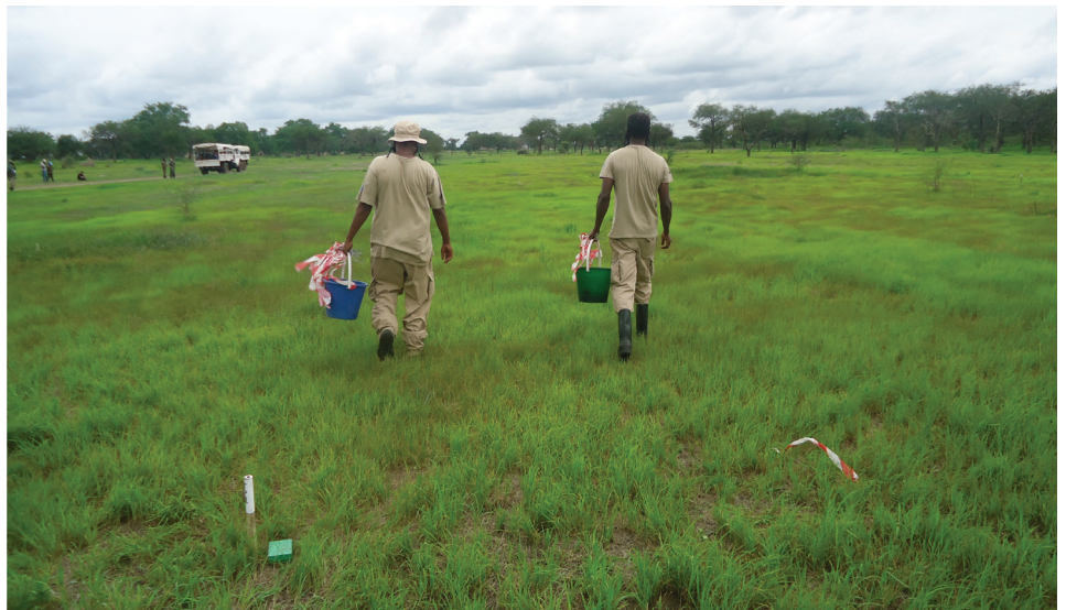
Battle area clearance of a helicopter landing site at Dungoup

Simultaneous with the EOD response activities, locally recruited Community Liaison Officers (CLOs) are delivering safety briefings in the villages of Abyei, Agok and Diffra and raise awareness in the communities about ERW hazards and safe behaviour. Despite the movement limitations imposed by the rainy season, the local CLOs have been intensively conducting their briefings in northern, southern and central Abyei, moving on foot. As they are based in their respective areas of responsibility, they continue to build a relationship with the communities which enhances the flow of information and, in future, could limit the exposure of the community to ERW hazards.