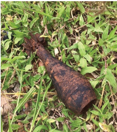
60mm mortar, free from explosive found and removed

On a second task, the team responded to a call-out from Amiet market regarding an unexploded ordnance (UXO) reported next to the Abyei – Diffra main supply route. The item was identified as a 60mm mortar, free from explosive, and subsequently removed. As the item is safe to handle, it will be kept in UNMAS storage for instructional and demonstration purposes.