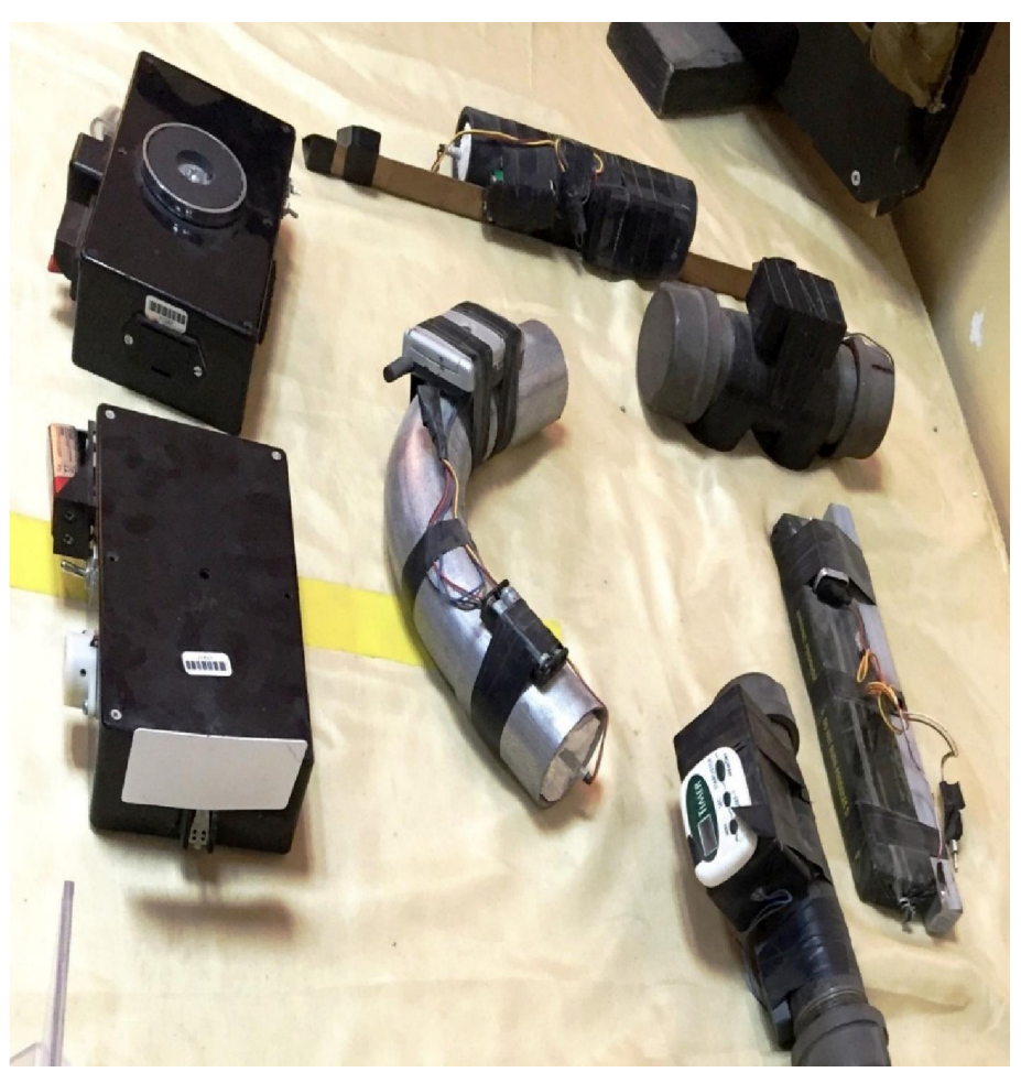
Left: typical armoured Daesh large vehicle-borne IED. Estimated to be carrying 1-1.5 tonnes of high explosive and Right: Various Daesh under vehicle booby trap designs with Victim Operated, Command and Time switches