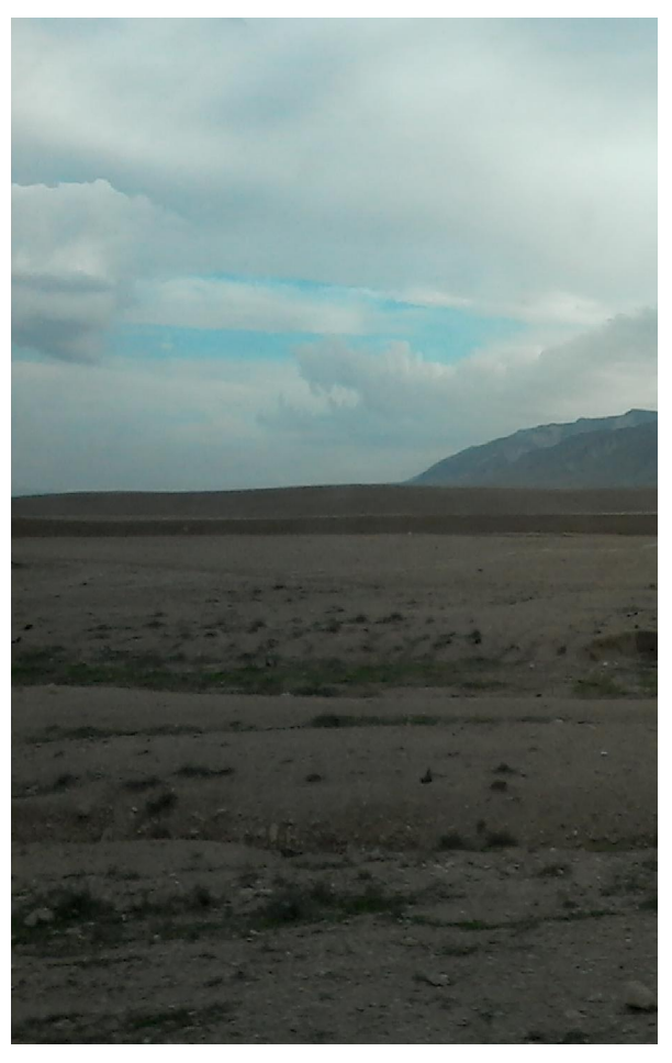
Improvised pressure plate switches used in improvised landmines and an area contaminated with hidden IEDs (much like "minefields") (location: South of Rabiaa)