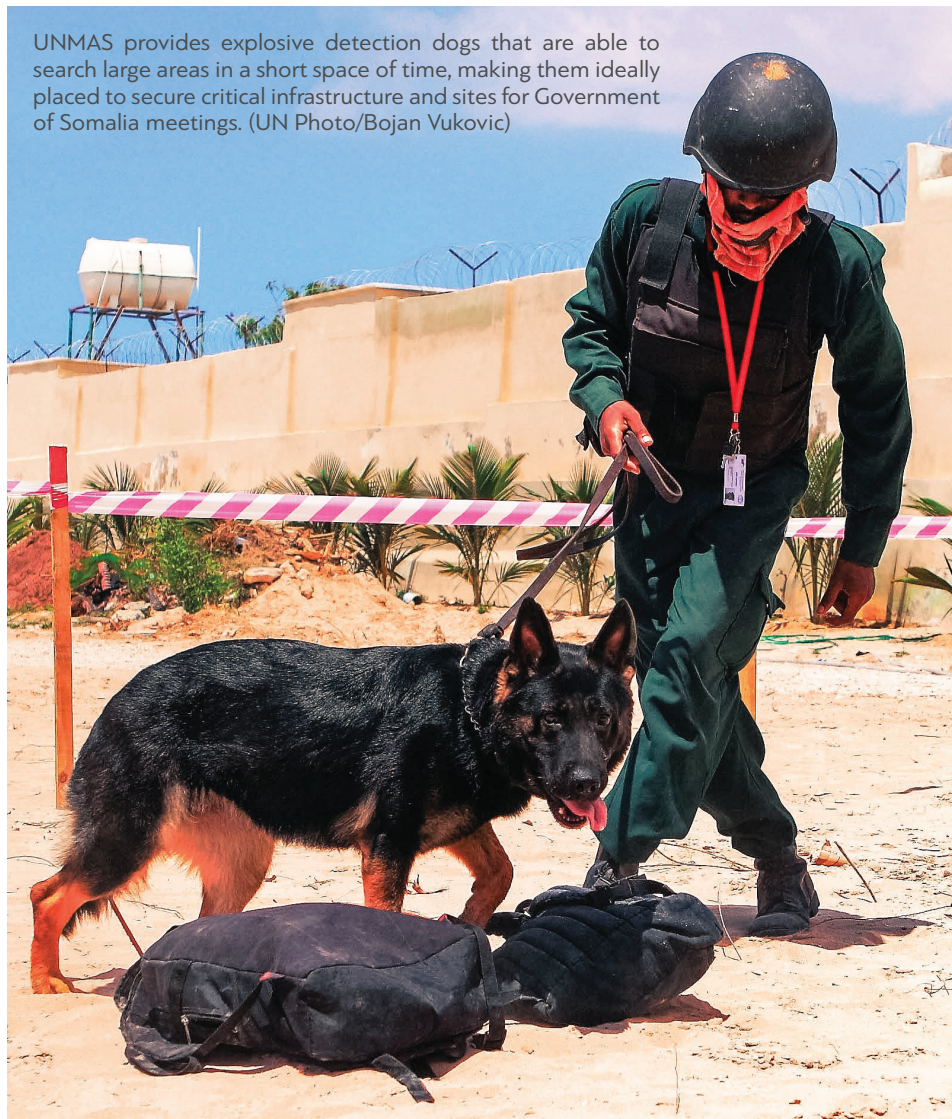
UNMAS provides explosive detection dogs that are able to search large areas in a short space of time, making them ideally placed to secure critical infrastructure and sites for Government of Somalia meetings.

Since 2009, UNMAS has been training the Somali Police Force (SPF) in Explosive Ordnance Disposal (EOD), successfully preparing 11 teams to respond to Explosive Remnants of War (ERW) and other explosive