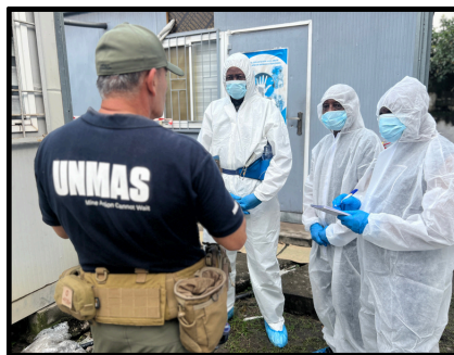
Investigation debriefing, January 2025