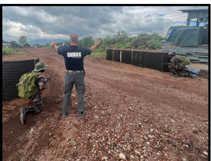
Setting up a safety cord, November 2024