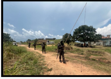
Implementation of tripwire detection by patrols