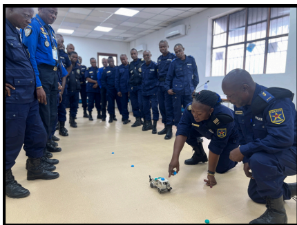
Convo training, January 2025