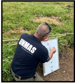
Refresher on tripwire detection