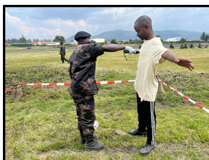
Personal searching exercise using a metal detector, December 2024