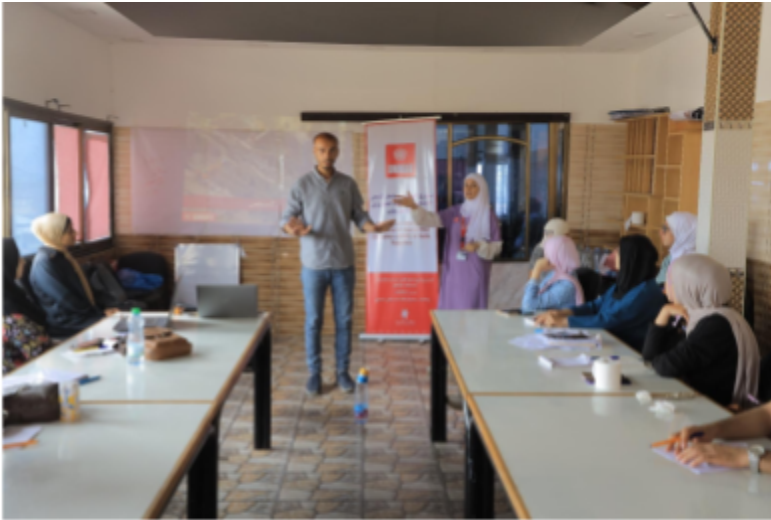
[Photo caption: EORE training provided by UNMAS EORE Officer to SYF teams ]

In an effort to widen the provision of life-saving messages to at-risk populations, UNMAS provided a week-long Training of Trainers (ToT) course to 22 personnel of the new national implementing partner Safe Youth Future Society (SYF). The ToT included theoretical and practical portions, and training on the use of the UNMAS information management systems. UNMAS engagement with national partners is centered on a capacity enhancement approach, providing training and mentoring to organizations to continually improve and expand the effectiveness of their response in EORE. By the end of May, SYF was able to commence its provision of emergency EORE in Rafah, Khan Younis, and Deir Al Balah.