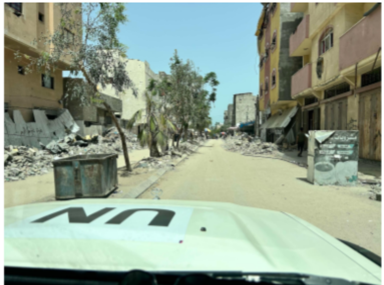
[Photo caption: UNMAS supporting a security and logistic reconnaissance convoy]

To increase the flow of humanitarian assistance, four EOD Officers provided route assessment and EHA of routes used by humanitarian convoys. Notably, the team supported the change of entry of humanitarian personnel and goods by conducting nine route assessments of the roads being used at the Kerem Shalom crossing alone, after the Rafah crossing was closed on 7 May. In this way, due to the efforts of the UNMAS team, the UN and humanitarian sector was able to be responsive to an evolving context and ensure the safe, continued flow of goods and movement of humanitarian actors.