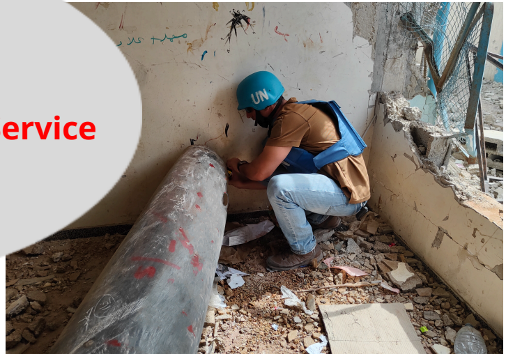
[Photo caption: EOD Officer carrying out an EHA at Al Qarara Elem & Prep Coed School in KhanYunis ]