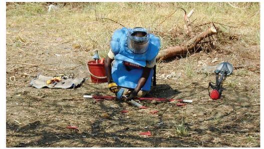
Battle Area Clearance

352,092 square meters cleared in the Abyei Area