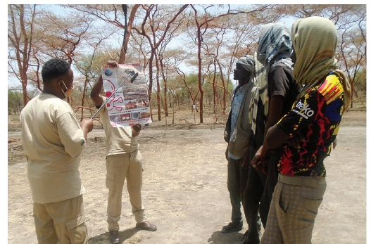
Explosive Ordnance Risk Education session in Koledit

37 Explosive Ordnance Risk Education sessions provided