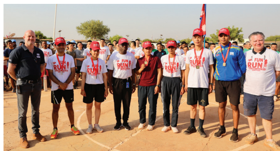
Fun Run medalists with dignitaries