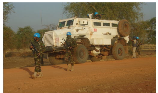
Ground Monitoring Mission in Tishwin