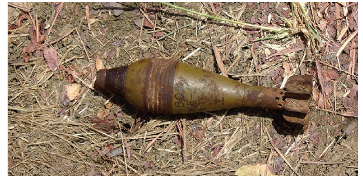
One of explosive remnants of war recovered and destroyed