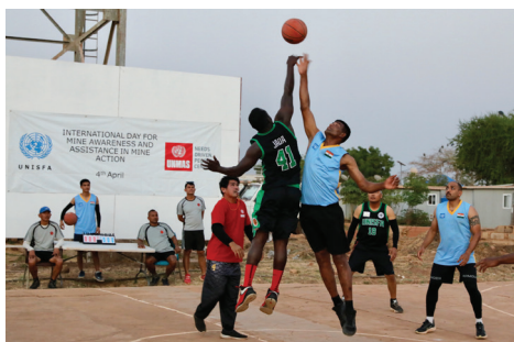
Basketball's final match