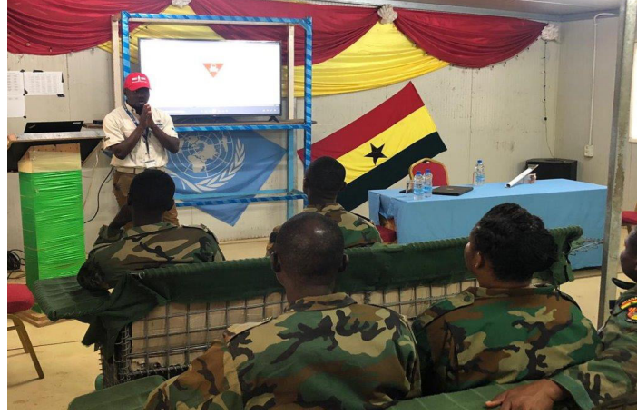
Safety briefing session in Aldaier