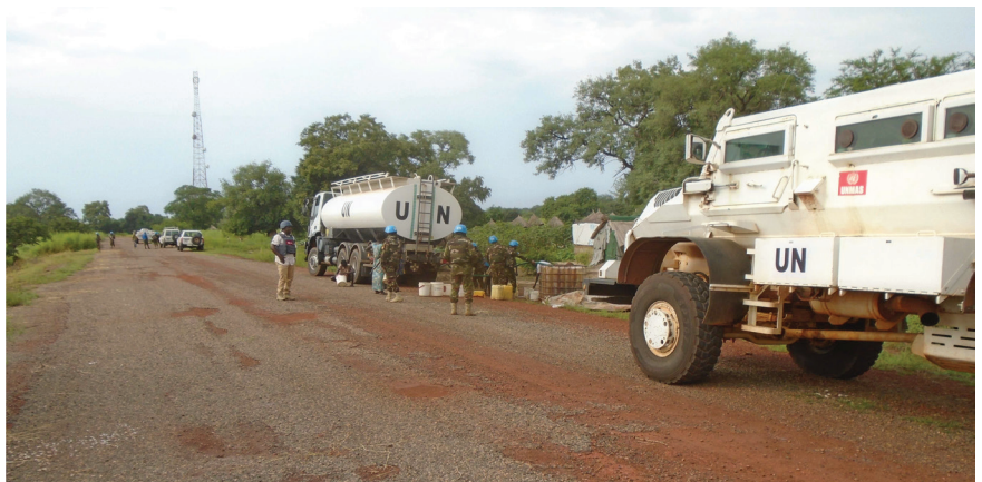
Fanikan water delivery in Abu Qussa