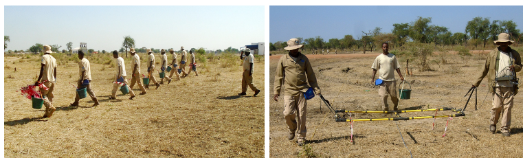
Battle area clearance (BAC)