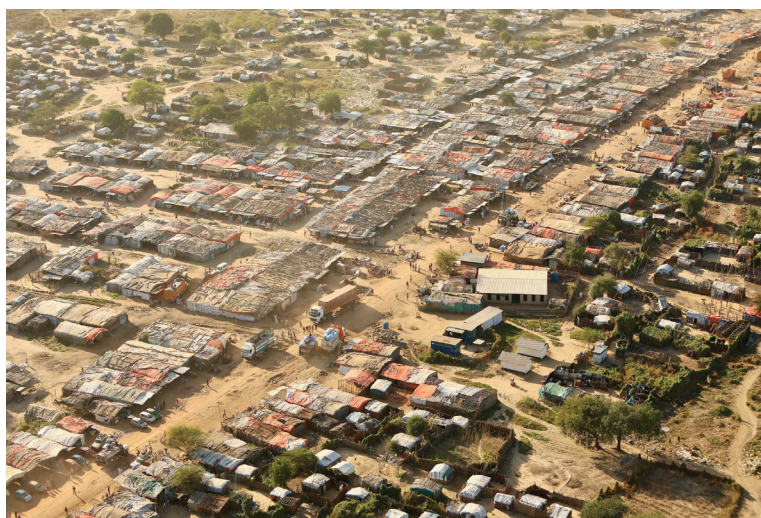
Amiet market from the air