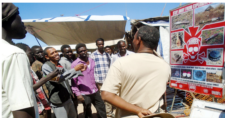
Explosive ordnance risk education session

Since 2011 and due to fighting among the Ngok Dinka and Misserya, who are the predominant tribes of the Abyei Area, not much interaction took place. In the meantime, the population of the Abyei area has grown significantly, from 100,000 in 2011 to 200,000 in 2019. Several attempts to open or establish markets for the people of Abyei ended up in unrest and clashes until 2016 when a deal was made to establish a market in the vicinity of Todach, the hidden borderline between the two tribes. UNMAS was requested to conduct clearance of the designated area and to ensure safety from explosive hazards. At that moment, three years ago, there was not a single hut or house in that area. Nowadays, Amiet market has become the main place (hub) for trade, the artery for trade between Ngok Dinka and Misseriya, but also many other tribes arriving for the same reason, to buy or sell, to meet and greet.