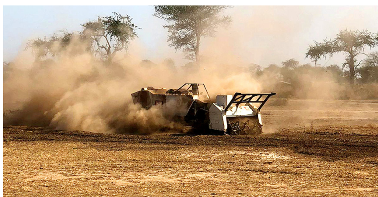
Use of mechanical assets