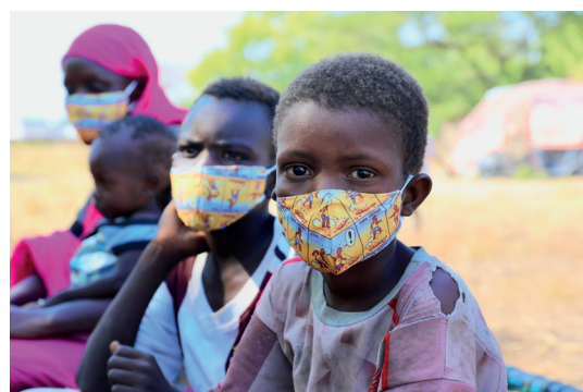
Face masks provided prior to EORE session in Diffra