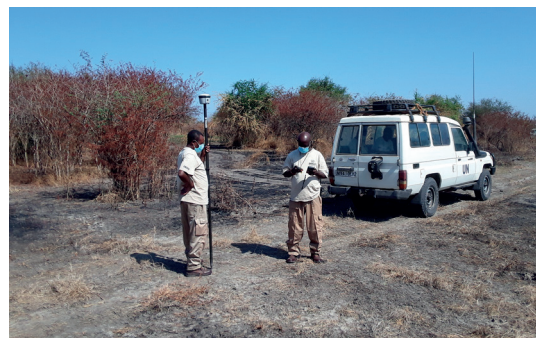
Route assessment Hadid-Shegeg