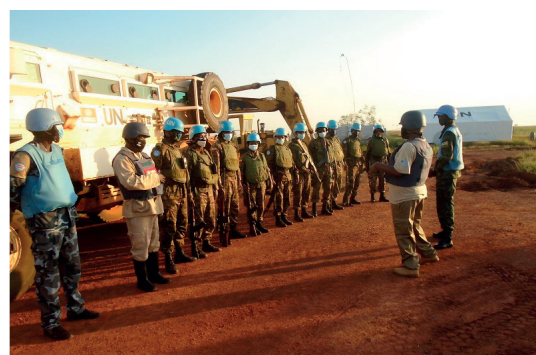
Ground monitoring mission at TS-21