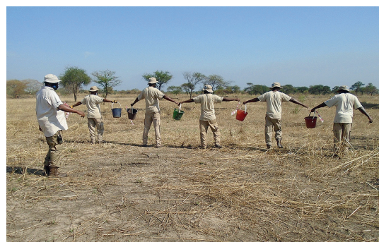
Battle area clearance in Um Khariet