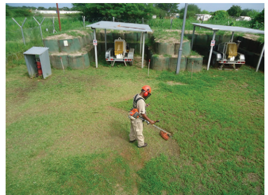
Ongoing maintenance at the Weapons and Ammunition Management facility

14 UNISFA military and civilian staff received safety training