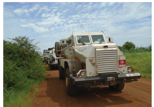
UNMAS convoy relocating to JBVMM Sector 1 HQ after the forced abandonment of TS 11 Kiir Adem

5 JBVMM Ground Monitoring Missions supported