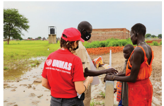
Explosive ordnance risk education delivered by Community Liaison Officers (CLOs) in Abyei town

Explosive Ordnance Disposal Response Team remains deployed at the Abyei HQ