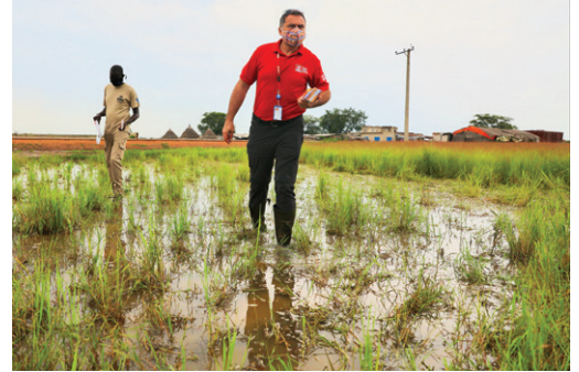
Explosive ordnance risk education continued throughout the rainy season

Rainy season continued Clearance teams remobilised by 30 September 2021