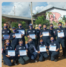
AUGUST 2020 First staff accredited by the OACP