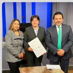
MARCH 2020 Signing of the Memorandum of Understanding