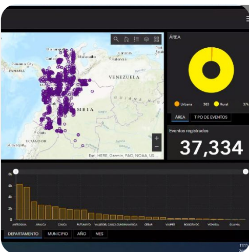
ARCgis viewer with data from Colombia

Within the framework of the joint work plan between the Mine Action Subgroup and the Child Protection Subgroup, UNMAS in collaboration with UNICEF, organized an Explosive Ordnance Risk Education (EORE) session addressed to 20 representatives of humanitarian organizations who work in territories affected by the presence of anti-personnel mines. The purpose of this session was to disseminate prevention messages among officials of organizations such as Save the Children, the Norwegian Council for Refugees and Terre des Hommes , to contribute to their protection and that of the beneficiary populations of their interventions. Through actions like this one, the two subgroups, which are part of the Protection Cluster, will strengthen the capacities of the organizations and the coordination of their humanitarian interventions.