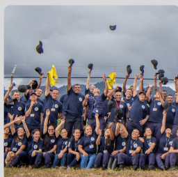
JULY 2018 Launch of the HUMANICEMOS DH Regional Base