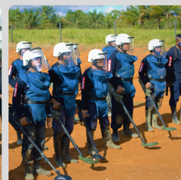
DECEMBER 2020 First teams of Manual Clearance (MC)