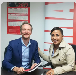
FEBRUARY 2018 Signing of the agreement with the UN-MPTF for Phase 1