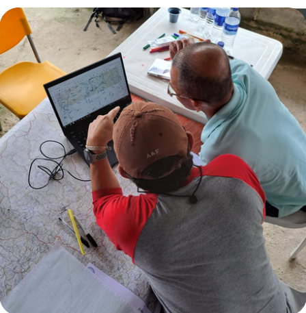
This project is implemented thanks to the financial support of Norway.

Between June 20 and 24, Geneva, Switzerland, hosted important events for the global mine action sector. The first activities were the intersessional meetings of the Conference of States Parties to the Anti-Personnel Landmines Convention , known as the " Ottawa Convention ", whose presidency is held by Colombia in 2022. UNMAS accompanied the OACP to these meetings, held between June 20 and 22. Additionally, on June 23 and 24, the International Meeting of Mine Action National Directors and United Nations Advisers (NDM) was held in the same city, in which UNMAS and the OACP held a discussion on the positive impact of humanitarian demining in the country , in which various relevant actors of the mine action in Colombia participated.