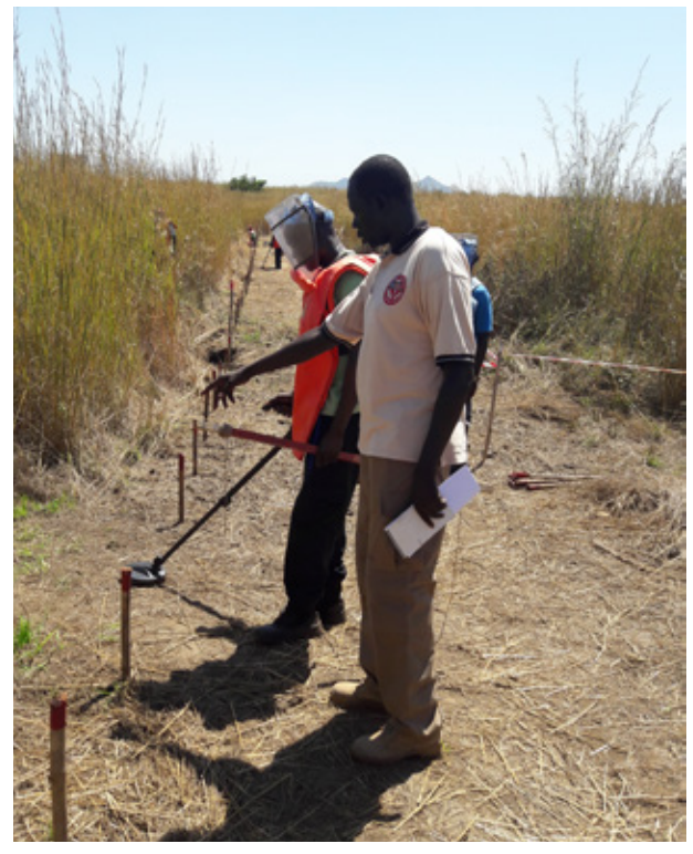
A National Mine Action Authority (NMAA) Officer conducting quality assurance during accreditation of a mine action implementing partner in Juba, Central Equatoria, South Sudan.

Province. Over a hundred ERW were disposed of and 8,000 Afghans provided with risk education