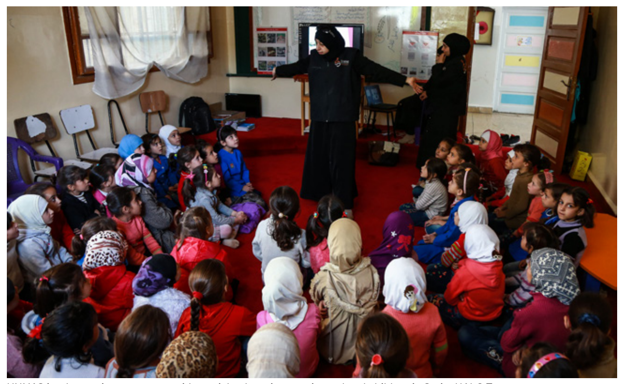
UNMAS implementing partner provides a risk education session to local children in Syria.

Surveying the extent of explosive contamination and its human and socio-economic impact as well as providing immediate and life-saving risk education are critical first steps in responding to the urgent needs of people caught up in conflict. In Syria , the steadily growing explosive