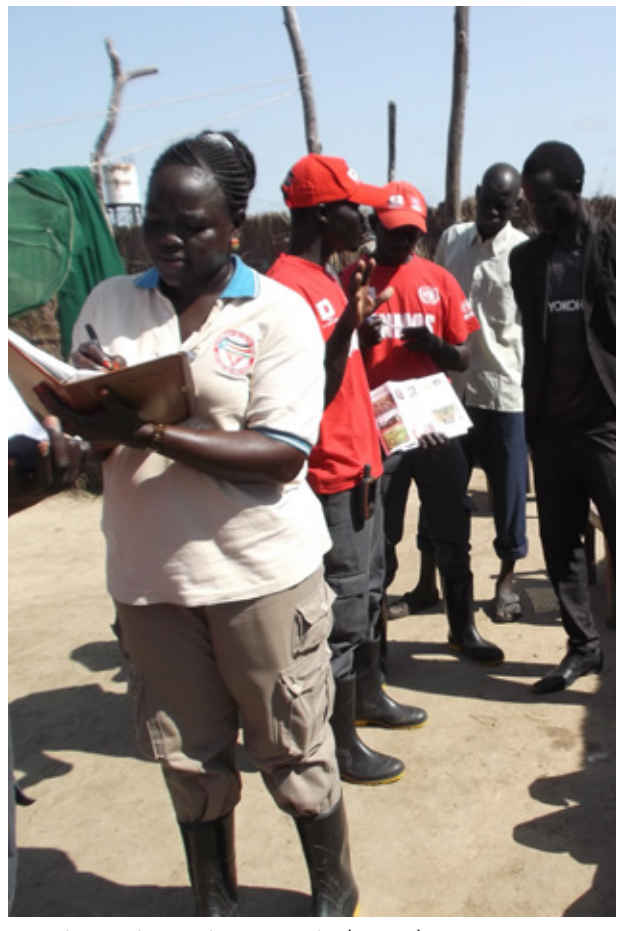
A National Mine Action Authority (NMAA) Officer and UNMAS jointly conducting quality assurance activities in Pariang, Unity, South Sudan.

In March, at the request of the Resident Coordinator, the RRTSC deployed to Papua New Guinea to assess the prevalence of weapons and ammunition contamination in the Autonomous Region of Bougainville, in support of the implementation of the Bougainville Peace Agreement. UNMAS provided recommendations on how to make the Autonomous Region of Bougainville "weapons free" as required by provisions in the peace agreement.