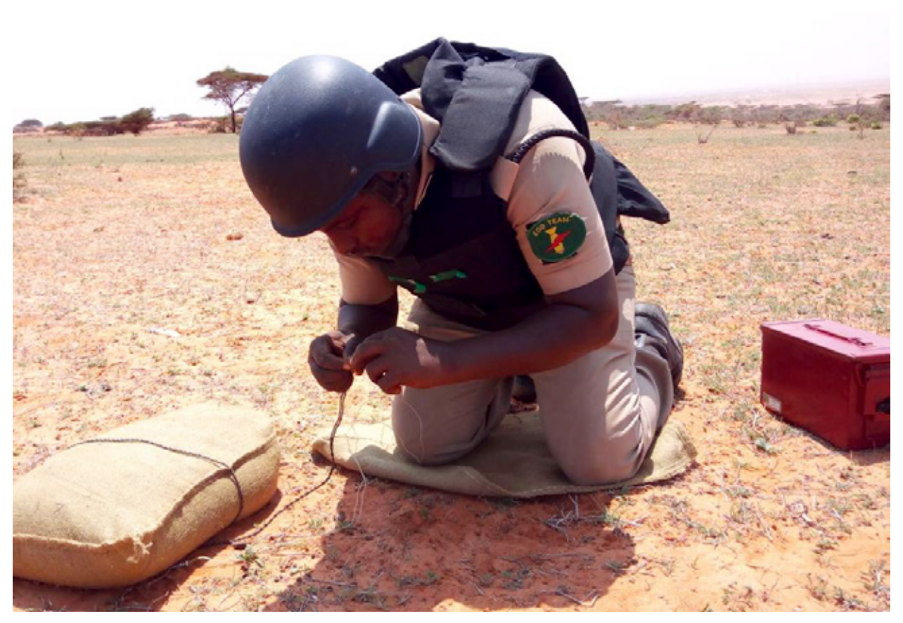
UNMAS trains Somali EOD Police on demolition techniques in Somalia.

year history of the programme. In Somalia, the Somali Explosive Management Authority assumed chair of the explosive hazard subcluster, an important step towards transitioning protection and coordination responsibilities to the Government. These achievements result from UNMAS steadfast and consistent support to national mine action authorities. From Sudan where this year UNMAS mentored National Mine Action Center staff as they established a quality management system and updated national technical guidelines, to Libya where UNMAS assisted the Libyan Mine Action Centre to coordinate the activities of implementing partners, to the Democratic Republic of the Congo, where UNMAS helped the National Mine Action Authority to reactivate the MA AOR of the GPC and to Colombia where