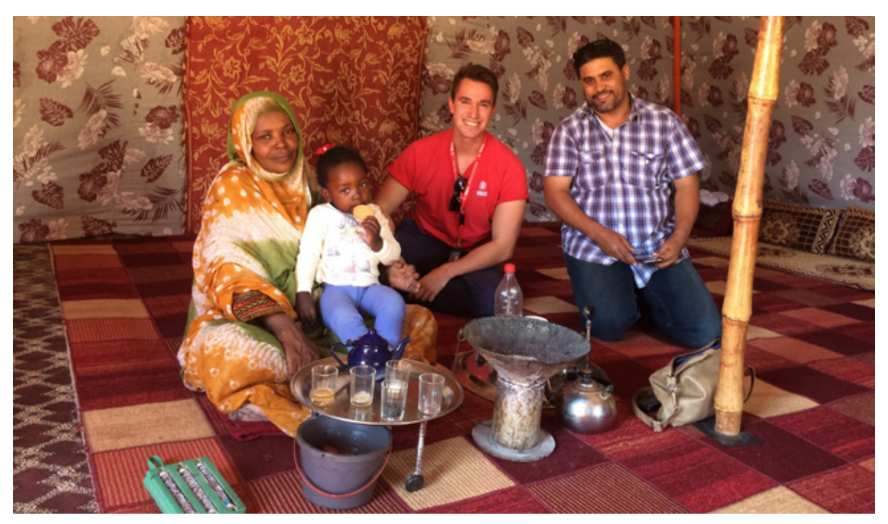
Survivors of mine accidents living in the Tindouf refugee camps (Algeria) face social exclusion and poverty. UNMAS provides socio-economic reintegration opportunities to survivors and their dependents.

UNMAS ensured that survivors received the care they needed while establishing a sustainable support system. With UNMAS guidance, the model has been replicated in the West Bank, where the national authority now maintains