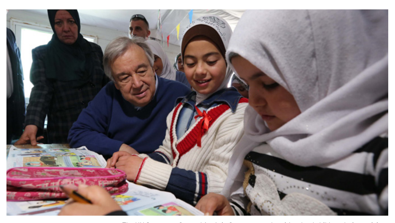
The UN Secretary-General António Guterres speaks with school children during a visit to Zaatari refugee camp in Jordan. UNMAS and its partners are clearing explosive hazards to clear the way for refugees to return home and provide risk education to displaced persons and refugees in and around Iraq and Syria.

António Guterres, United Nations Secretary-General