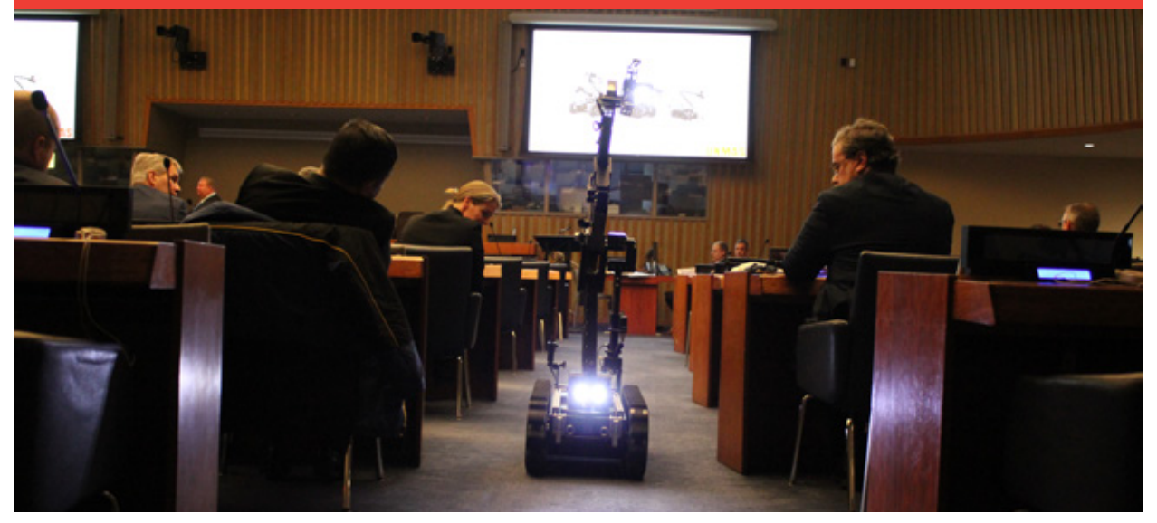
IED threat mitigation equipment is introduced to participants at the UNderstanding IED workshop held in New York for Permanent Missions to the United Nations and UN staff.

Early December, UNMAS advocacy and awareness raising undertakings specific to IED threat mitigation benefitted from the diplomatic and financial support and technical contribution of the Kingdom of the Netherlands. Two one-day workshops entitled "UNderstanding IEDs" held in New York, at United Nations Headquarters, promoted a better understanding of the threat posed by IEDs and the measures taken by the United Nations to mitigate that threat. Opened jointly by the Permanent Representative of the Kingdom of the Netherlands to the United Nations and the Director of UNMAS, these "hands on" interactive workshops enabled participants to use multi-media technologies and IED threat mitigation equipment to showcase actual field situations and encourage extensive exchanges between participants and experts. UNMAS technical IED specialists from Iraq, Somalia and Mali shared their personal experience and knowledge with United Nations staff and United Nations member states representatives. The great interest and very positive feedback of participants led UNMAS to replicate the workshops at its February 2019 gathering of the mine action sector in Geneva.