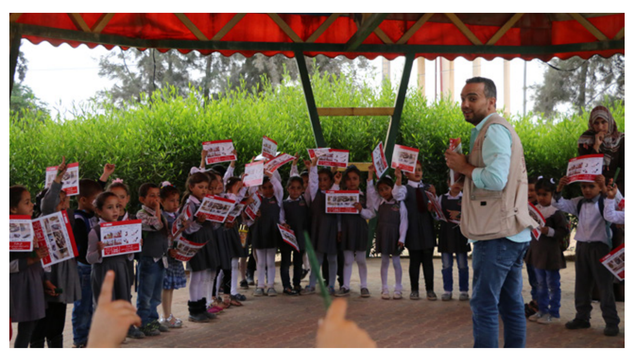
Due to the continuing risk from explosive remnants of war, accidents are reported too often, UNMAS prioritizes risk education in Gaza.

and the Convention on Cluster Munitions. The new legislation bans the use, acquisition, and stockpiling of weapons, ammunition, and explosive items and formally designate the Directorate of Mine Action as the Government body in charge of coordinating mine action in Afghanistan. Also on legislation, in Somalia, UNMAS worked with national and international partners to support the processing of mine action legislation through the Parliament and the development of a Somali-led mine action strategy. The Government of Somalia, with support from UNMAS, launched the "Badbaado Plan" for 2018-2022 which outlines its plans and financial requirements to manage and reduce the impact of explosive hazards throughout the country. Similarly, in South Sudan, the National Mine Action Strategy for 2018-2021, developed with assistance from UNMAS, was launched, as was a National Development Strategy for 2019-2021, in which mine action is featured as a key issue for governance and security. In Colombia, UNMAS advisors to Dirección Descontamina Colombia supported the inclusion of mine action in the National Development Plan and the integration of mine action within other national priority programmes such as those related to land restitution and the voluntary substitution of illicit crops.