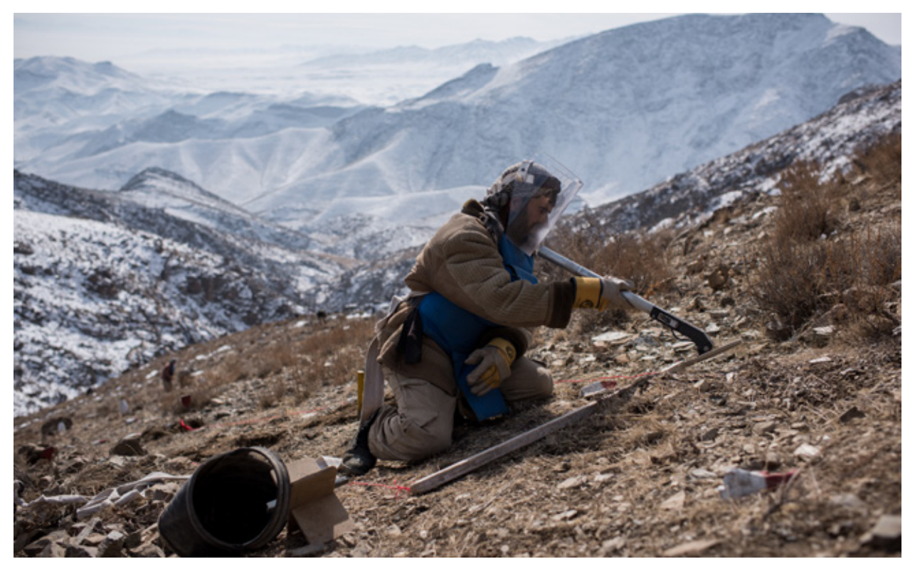
Mine clearance operations continue throughout the harsh winter to release the remaining 1,505 communities affected by landmines and explosive remnants of war.

The trend towards increasingly restricted contributions continues to impact the ability of UNMAS to deliver all aspects of its mandate,