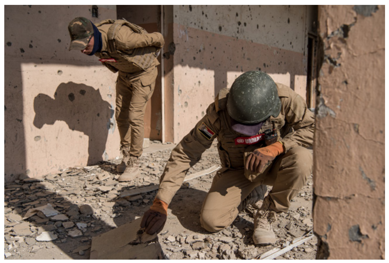
UNMAS conducts clearance operations at Al-Hadba School, West Mosul, Iraq.

removed two IEDs allowing for UNDP to safely carry out rehabilitation of the bridge, which is now crossed by hundreds of vehicles a day.