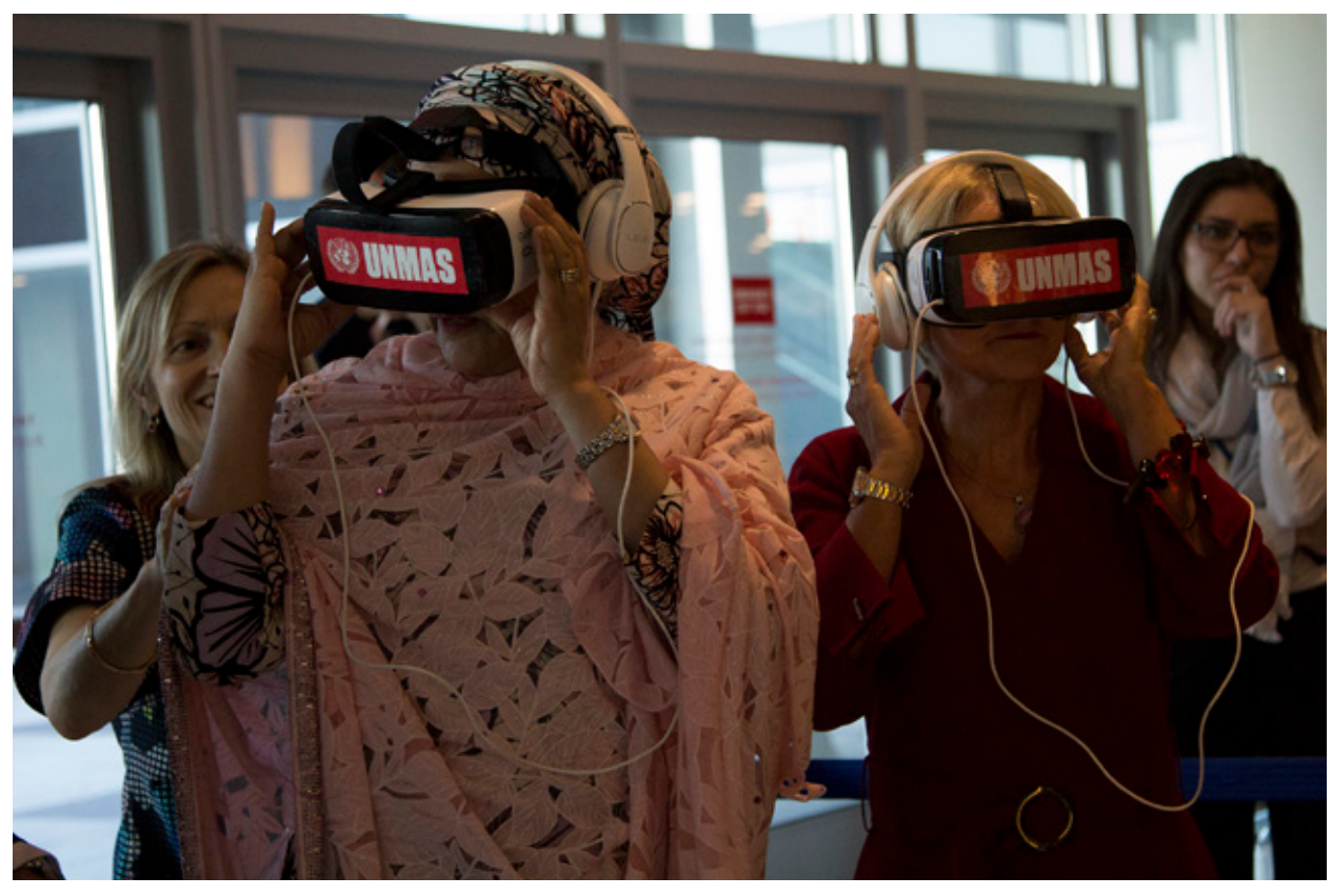
To celebrate the International Day for Mine Awareness and Assistance in Mine Action, at UNHQ, a multimedia exhibition, including 360-degree film footage from Afghanistan and Iraq, is opened by the Deputy Secretary-General and the Deputy Permanent Representative of Germany to the United Nations.

Thanks to the combined efforts of UNMAS and its worldwide network, UNMAS social media engaged over 19 million users for the Day, a record to date, and proving to constitute a valuable advocacy and outreach resource to raise awareness and communicate the needs of affected communities globally.