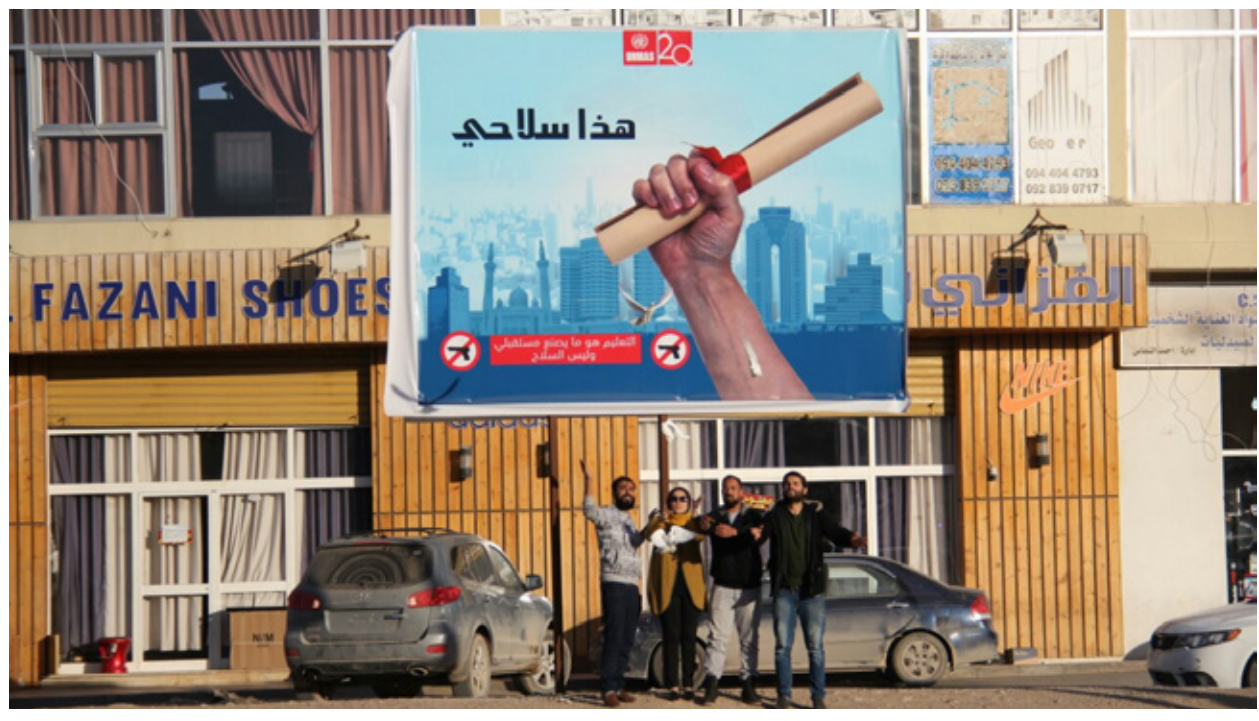
A billboard with message "Education is my weapon" in Libya.

UNMAS also addressed dangers posed to civilians through weapons and ammunition