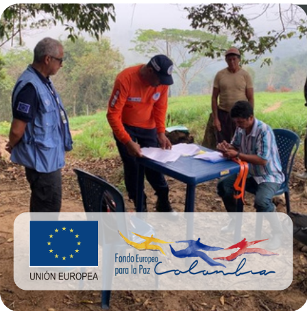
HUMANICEMOS DH operates with a grant from UNMAS, with the support of the European Trust Fund for Peace.