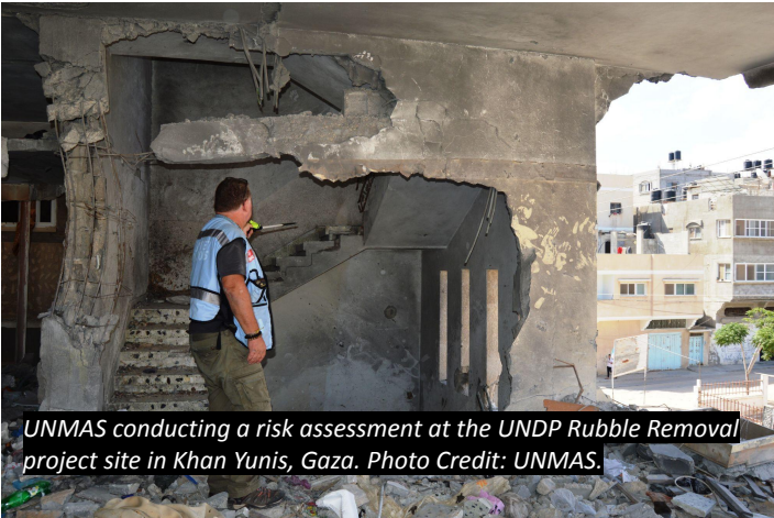
UNMAS conducting a risk assessment at the UNDP Rubble Removal project site in Khan Yunis, Gaza.

As part of the post-escalation effort on the ground, in support of the reconstruction of Gaza, UNMAS Palestine has been partnering with UNDP to conduct the Rubble Removal project through the provision of risk assessments for 150 sites across the Gaza Strip.