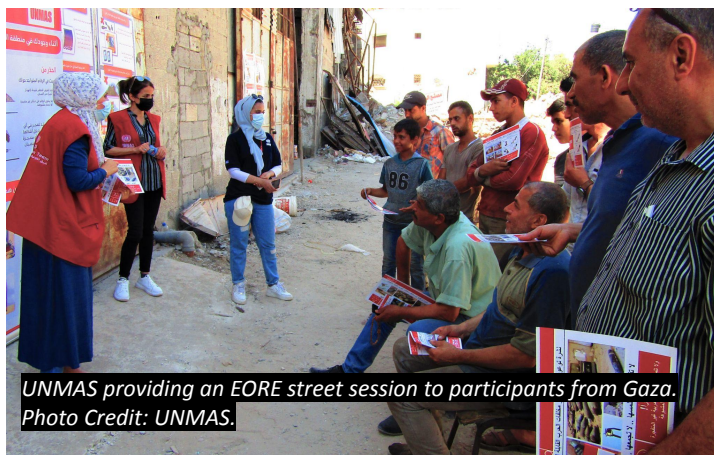
UNMAS providing an EORE street session to participants from Gaza.

Overall, 1,229 EORE sessions have been delivered, reaching 4,480 beneficiaries including 827 women and 1,768 children. Further, 7 Conflict Preparedness and Protection (CPP) sessions have been delivered, training 46 men and 26 women.