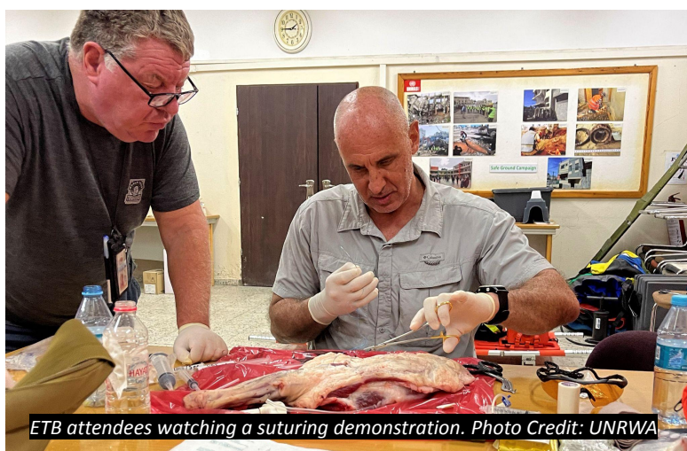
ETB attendees watching a suturing demonstration.

The training enables UN personnel to develop life-saving tools to provide emergency first response medical treatment in the event of casualties from a range of scenarios that might occur in Gaza.