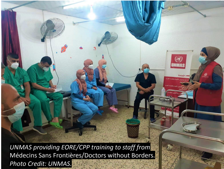
UNMAS providing EORE/ CPP training to staff from Médecins Sans Frontières/Doctors without Borders.

As part of their support to mitigate the risk from ERW in Gaza, UNMAS provides EORE and CPP training sessions to UN and other humanitarian actors. Recently UNMAS delivered these sessions to medical and administrative staff from multiple Doctors without Borders/ Médecins Sans Frontières teams across the Gaza strip. The 1-hour training included Explosive Remnants of War awareness information, risk mitigation methods and a CPP module covering safety measures to take during air strikes.